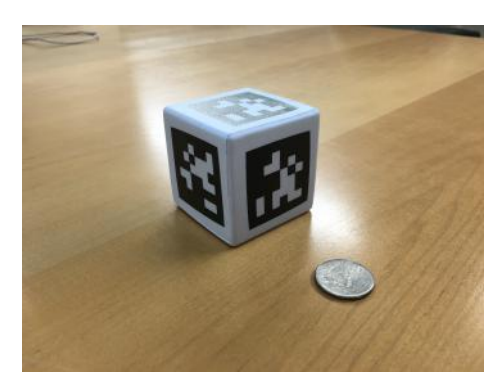
Figure 2: The April tag cube

Methods and Results: This research focuses on determining the distance between a tag and a rover. Based on the incoming camera image, the rover navigates to the location of april tag cube, which is an ideal food for the Swarmie. When the tag is within the rover camera view area, the rover calculates the distance between the tag and its current location. The most effective way to accomplish this is using ROS TF (Transform) to broadcast and listen to the transform between the incoming tag coordinates and base_link coordinate frame. By using the transform frame published by the apriltag_detection package, the coordinate points of the april tag is obtained. The broadcaster node then subscribes to this tag_detection topic and broadcasts the transformation from the head_camera to the base_link . Once the transform tree