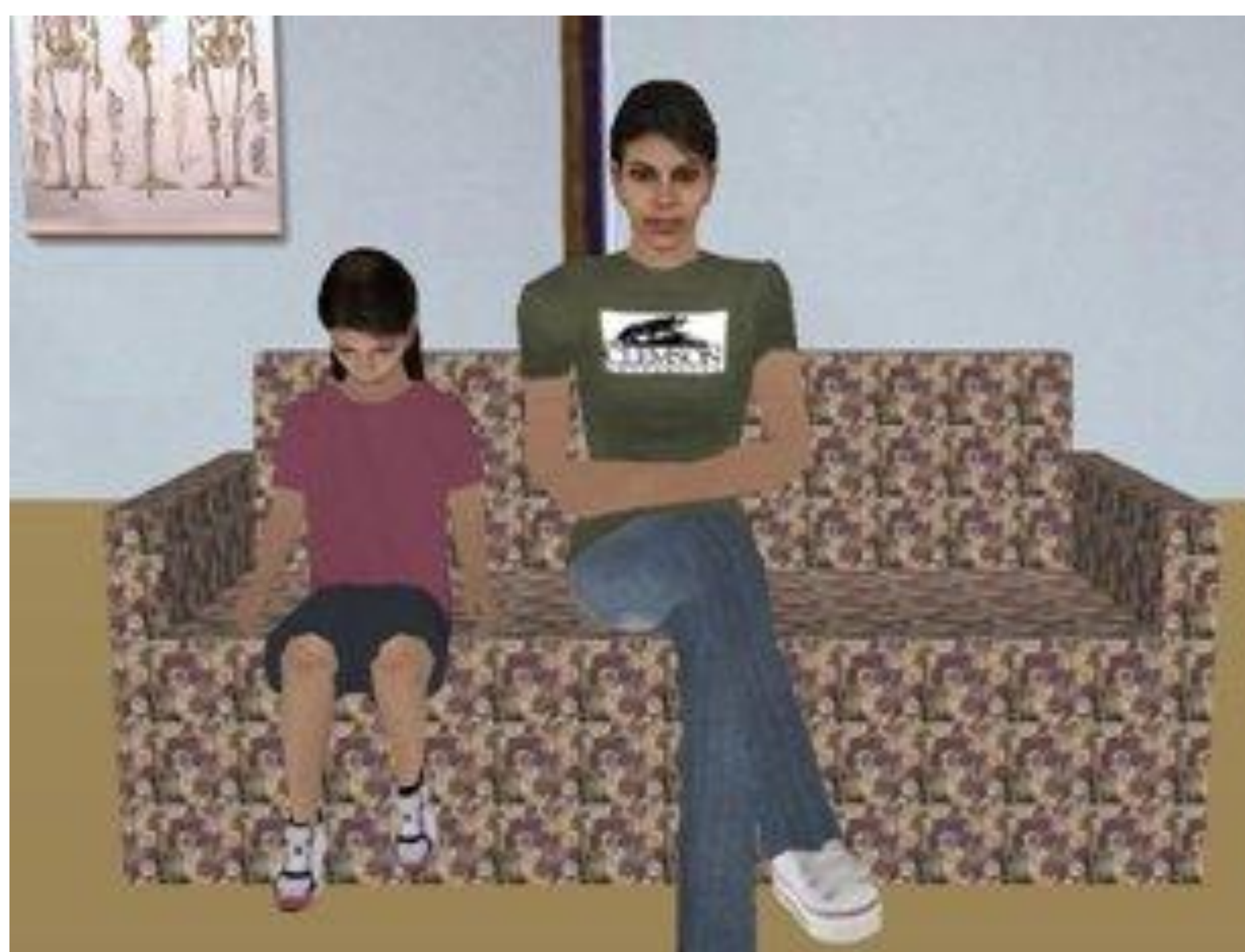
Characters in the first iteration